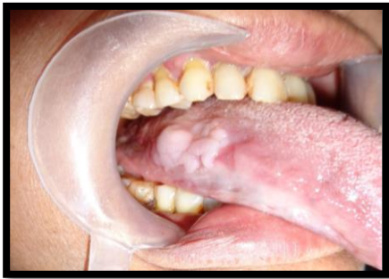
Figure 1. Swelling on the tongue