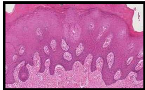
Figure 4. Histopathological changes