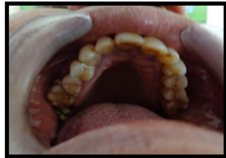
Figure 2. Grossly decayed maxillary molar