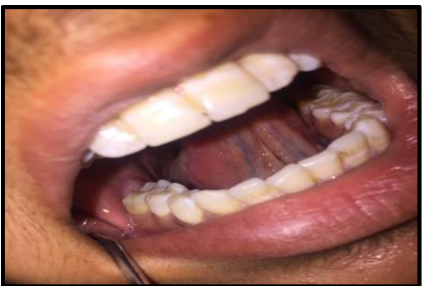
Figure 3. Intra-oral examination reveals absent 47 and 48