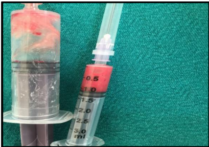
Figure 4. FNAC reveals a cystic content