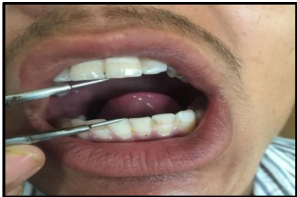
Figure 2. Inter-incisal opening = 24 mm