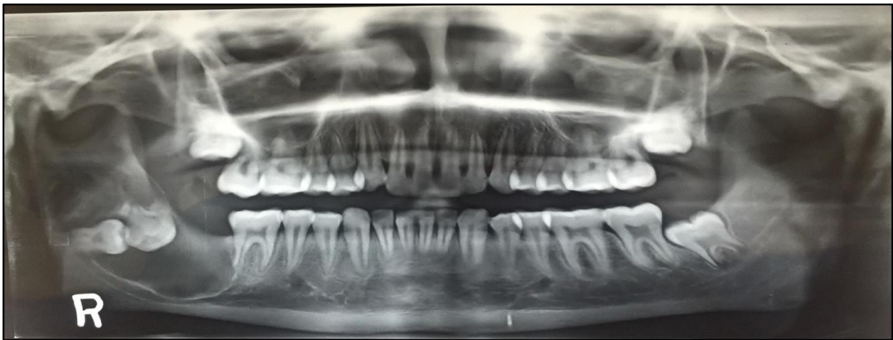
Figure 5. Panoramic radiograph reveals a well-defined unilocular radiolucency measuring about 2x4 cm with a scalloped outline seen in the right body and ramus of the mandible.