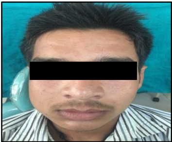
Figure 1. Extra-oral swelling on right side of the face

For article enquiry/author contact details, e-mail at: manuscriptenquiry.ihrj@gmail.com