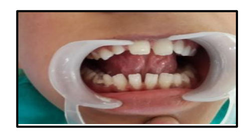
Figure 1. Presence of thick and short lingual frenum pre-operatively