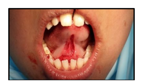
Figure 4. Presence of thick and short lingual frenum pre-operatively