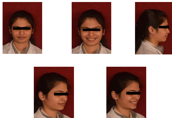
Figure 1 (b). Composite Extra Oral Photographs of a Female Subject

generations should have been residing in Patna, young adults with Class I occlusion, well-balanced facial profile, full complement of permanent teeth, normal overjet (2-3mm) and normal overbite (2-3mm) and mild crowding or spacing ( \leq 3 mm), mild rotations are considered as acceptable. The exclusion criteria were marked facial asymmetry, history of previous orthodontic treatment, craniofacial deformities, history of facial or systemic pathologies, history of trauma.