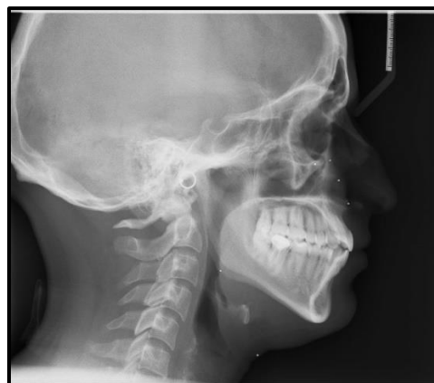
Figure 2. Lateral Cephalogram with Metallic Markers

the study. The landmarks and measurements were taken according to the Soft Tissue Cephalometric Analysis (STCA) 3 , which was studied and related to the True Vertical Line (TVL) as described by Arnett et al. 1,2