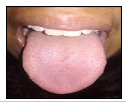
Figure 1. Photograph Reveals Large Size of Tongue

1. Size of tongue: Small and Large [Figure 1]