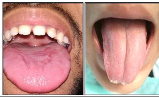
Figure 5 (a). Photograph Reveals Large and Broad Tongue and Figure 5 (b). Short and Broad tongue

5. Pattern on tongue surface : 1. Fissured: V shaped, Coated tongue 2. Branched: Horizontal, Vertical, Patternless 3. Cleft, 4. Geographic pattern, 5. Hairy tongue [Figure 5 a&b]