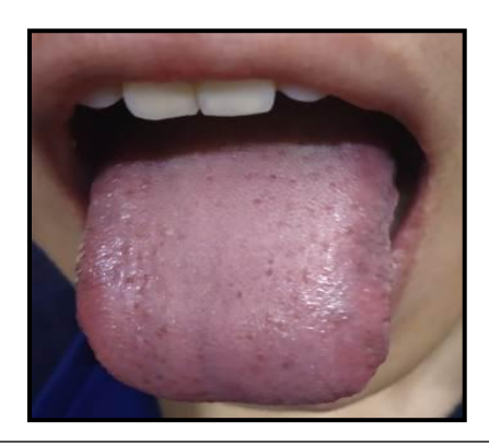
Figure 4. Photograph Shows Smooth Texture with Fungiform Tongue Papilla

4. Texture of tongue: Smooth, Rough, Ulcerated, Hairy, Edematous, Nodular [Figure 4]