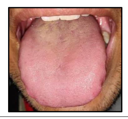
Figure 6. Photograph Reveals Scalloped Tongue Margins

6. Margins of tongue: Smooth, Scalloped , Ulcerated, Nodular [Figure 6]