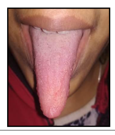
Figure 7. Photograph Reveals Pointed Tip of Tongue

7. Tip of tongue: Pointed (V shaped), Blunt (U shaped) [Figure 7]