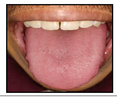
Figure 3. Photograph Reveals Normal Pink Color of Tongue

3. Color of tongue : Pale, Pink, Reddish, Whitish, Brown, Pigmented [Figure 3]