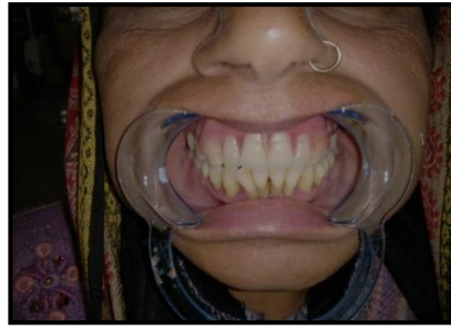
Figure 7. Intraoral frontal view of the flexible prosthesis in the patient's mouth