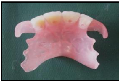
Figure 4. Palatal view of the flexible prosthesis