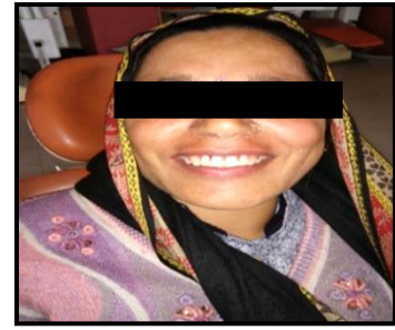
Figure 8. Postoperative view of the flexible prosthesis in patient's mouth

It hence, has been proven that flexible partial denture has several advantages over the other two types of partial dentures. Instead of using metal clasps, a flexible partial denture has a thin finger like extension extended into undercuts which act like a clasp. It is useful in patients having gingival recession as they appear elongated and for patients allergic to acrylic. 2 However, fabrication of flexible partial and complete dentures is contraindicated in cases with insufficient inter-arch space i.e., less than 4mm space, with prominent residual ridges where there is less space for labial placement of teeth because T-shape holes are necessary for mechanical retention of teeth to denture base, and with flat- flabby ridges with poor soft tissue support which require more rigid prosthesis. 3