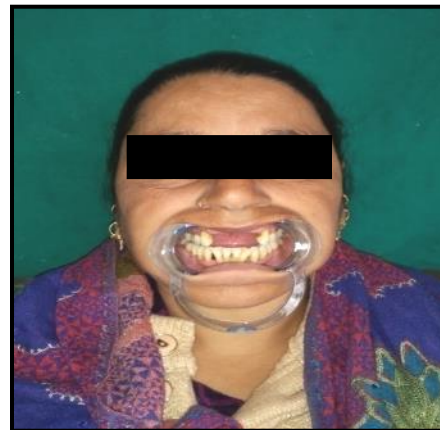
Figure 1. Preoperative view

• Firstly, alginate impressions were made and diagnostic casts were prepared (Figure 3).