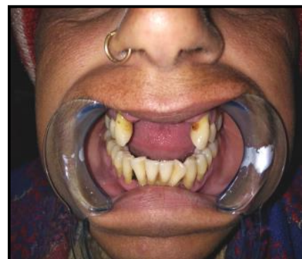
Figure 2. Intraoral view