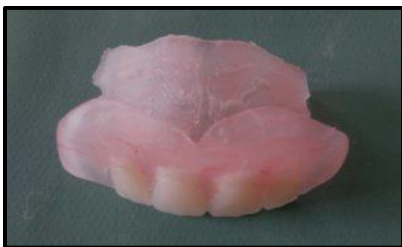
Figure 5. Labial view of the flexible prosthesis