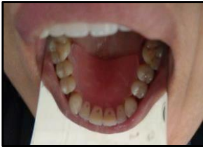
Figure 6. Intraoral palatal view of the flexible prosthesis in the patient's mouth