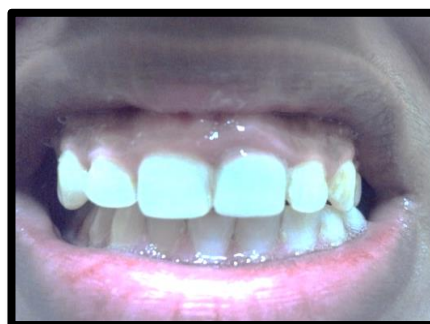
Figure 4. Post-operative photograph

In this procedure, tooth was isolated and gutta percha was removed with a small starter drill and the canal is prepared with the matching sized post drills and posts. All remnants of gutta percha must be removed from the walls of the post space to facilitate bonding. The fiber post was then inserted with the paracore material (Coltene) and shortened to the height of the core with a diamond bur before the bonding procedure is started.(Figure 2)