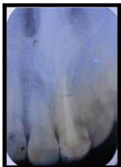
Figure 1. Pre-operative Photograph