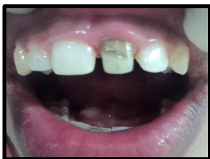
Figure 3. Core Build up and Crown Preparation