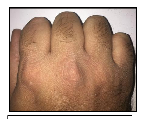
Figure 2. Resolution of Symptoms

flour, ginger paste, garlic paste, curd, lemon, salt, red chilli powder) as the same were being used daily for other food preparations. Moreover, such reaction was not seen while marinating other fish varieties. The patient was frequently consuming the same type of fish, but never experienced this before. A diagnosis of fish induced allergic contact dermatitis was suspected and the subject was asked to get evaluation done for IgE sensitization and challenge testing to which he refused. The patient was prescribed fluticasone propionate ointment and paraffin containing emollient, both twice daily for 2 weeks and oral levocetirizine twice daily for first week followed by once daily for second week. He was also advised to abstain from fish and fish products. He showed up after 15 days for a follow up visit with resolution of symptoms (figure 2).