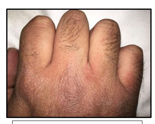
Figure 1. Clinical Presentation

flour, ginger paste, garlic paste, curd, lemon, salt, red chilli powder) as the same were being used daily for other food preparations. Moreover, such reaction was not seen while marinating other fish varieties. The patient was frequently consuming the same type of fish, but never experienced this before. A diagnosis of fish induced allergic contact dermatitis was suspected and the subject was asked to get evaluation done for IgE sensitization and challenge testing to which he refused. The patient was prescribed fluticasone propionate ointment and paraffin containing emollient, both twice daily for 2 weeks and oral levocetirizine twice daily for first week followed by once daily for second week. He was also advised to abstain from fish and fish products. He showed up after 15 days for a follow up visit with resolution of symptoms (figure 2).