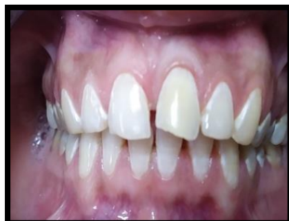
Figure 5. Follow up after one week