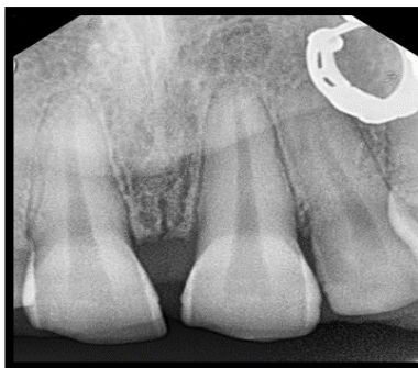
Figure 2. Preoperative radiograph