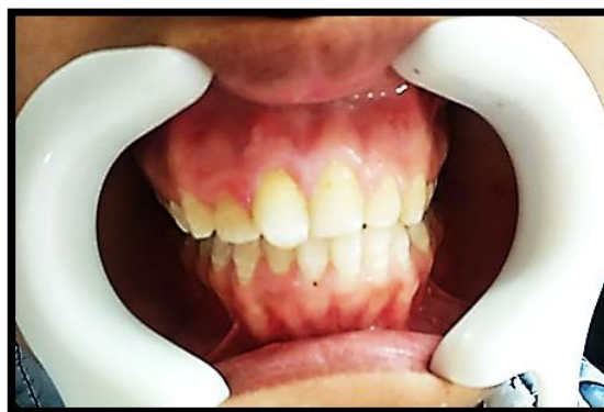
Figure 10. Post-operative photograph

agent like aluminum chloride and oxalic acid were identified. 14,15