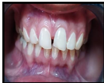
Figure 6. Post-operative photograph

and 1 to 2 mm glass ionomer cement (GIC) (Ivoclar Vivadent) was placed over it to create a mechanical barrier between the root canal at the level of cemento enamel junction (figure 4). Bleaching agent was placed inside pulp chamber using applicator tip then cavity was sealed by using zinc phosphate (ShofuHy-Bond Zinc Phosphate Cement) as temporary restoration. Bleaching was carried out using a paste of sodium perborate prepared by mixing with distilled water. In this case, the same procedure was repeated every 1 week in two-time interval (figure 5). After two weeks, the anticipated results were achieved with better cosmetic appearance, even the shade got lighter to A1 (figure 6). Following this, the tooth was then permanently restored using composite resin (3M EspeFiltek Z250 Xt).