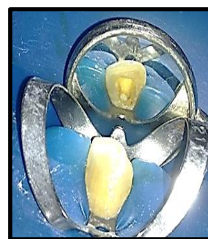
Figure 9. After placing bleaching agent

days. The shade changed to A2 from A3.5 (figure 10). The tooth was then permanently restored using composite resin (3M EspeFiltek Z250 Xt).