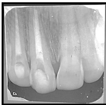
Figure 8. Radiograph after placing GIC barrier