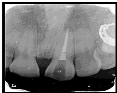
Figure 4. GIC placed at level of CEJ