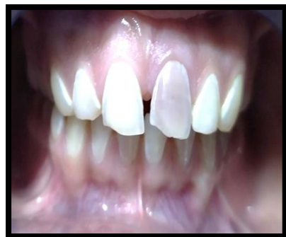
Figure 1. Preoperative photograph