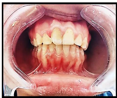
Figure 7. Preoperative photograph