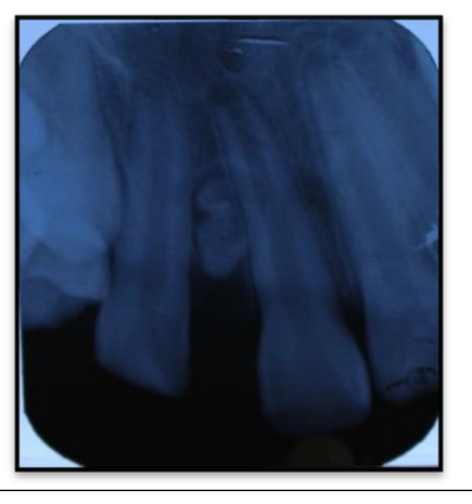
Figure 2. Intraoral Periapical Radiograph Showing Multilocular Radiolucency