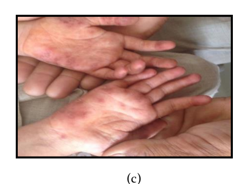
Figure 1 a-c. Examination of the Patient