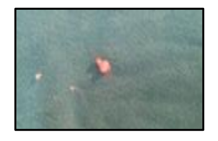
Figure 2. Biopsy Specimen