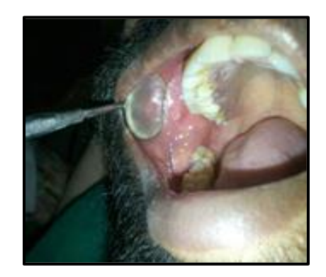
Figure 5. Lesion after Healing