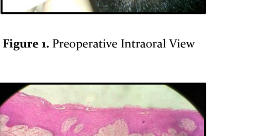
10x Figure 3(a). Histopathological Image