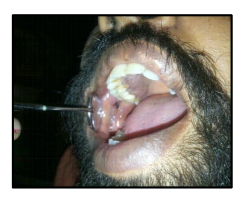
Figure 4. Post-operative Intraoral View