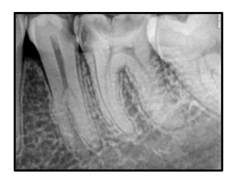
Figure 1. Pre-operative Radiograph (IOPA)