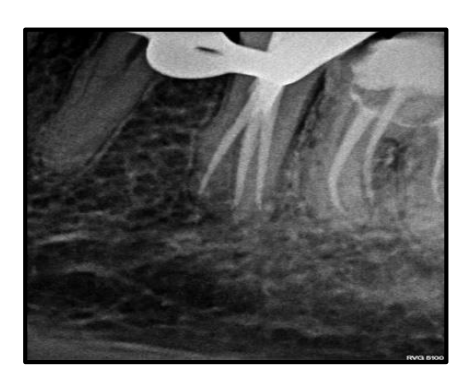
Figure 4. Obturation