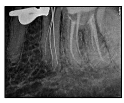
Figure 2. Working Length Determination